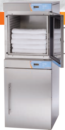
EC250 over EC750