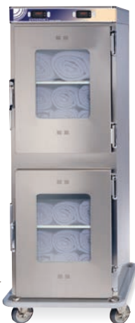
Shown with optional bumper