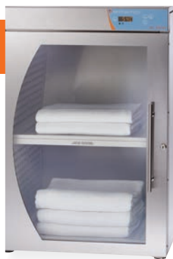
Shown with optional left-hinge window door, lock and casters